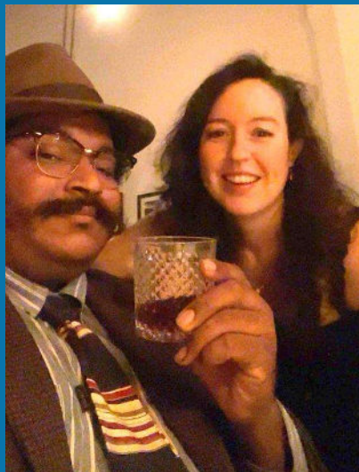
LIVE RAGTIME! SILENT MOVIE!