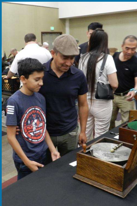
APS Banquet & Auction